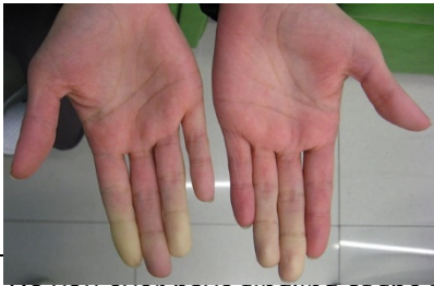
Vibration can damage the blood vessels in the hands and cause the fingers to turn white.